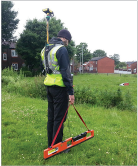
Electromagnetic conductivity.