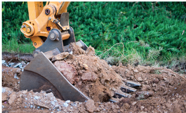
Pit or trench dug to investigate soil conditions from the surface and to obtain samples.

Pits and trenches enable us to observe the profile of the ground from the surface and obtain samples for testing. If it is critical to closely examine the ground, the sides of the excavation are shored with timber or a purpose-made support system before any work is carried out. Excavations reinforced in this way are called either observation pits or trenches.