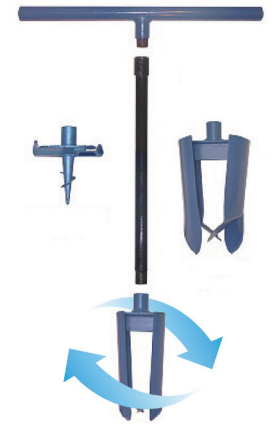
Hand auger borehole.

This method requires only one person and can usually be completed in a matter of hours.