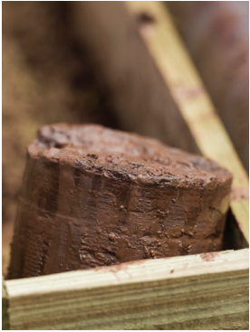
Core samples undergo physical and chemical laboratory testing.

Laboratory testing is divided into two broad categories: physical and chemical.