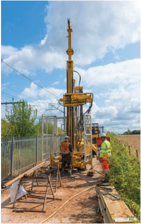
Drilling of a small borehole via a rotary core rig.