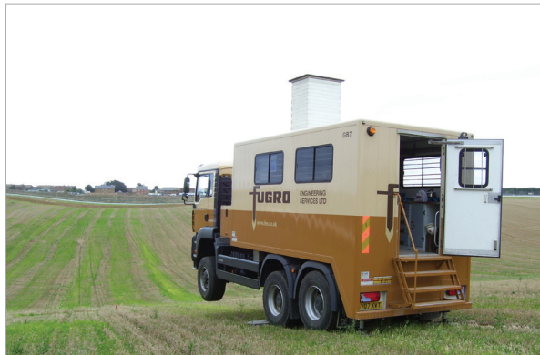
Cone penetration testing.

The cone is generally used to investigate less strong soils. Sensors on the cone can measure a variety of properties of the ground, including resistance, friction and water pressure. The results enable us to produce a profile of the layers the cone passes through and to assign properties to the different materials. This technique is normally used in rural locations where the ground is soft, such as flood plains. It requires two people, but tests are generally short (30-60 minutes) so they can carry out multiple investigations each day.