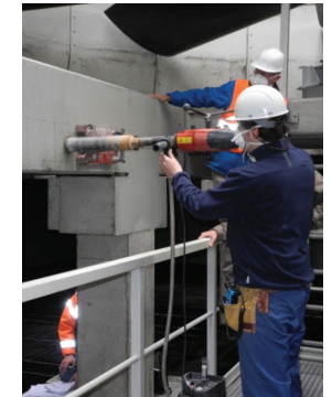
Concrete core (structural investigation).