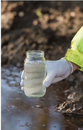
Surface water sampling.