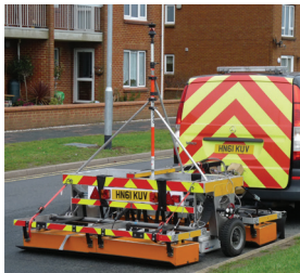
Large-scale ground-penetrating radar can be attached to a van.

Surveys can locate underground metal tanks, utility pipes and contaminated groundwater. They can also identify areas that need further geophysical or 'in-ground' investigation.