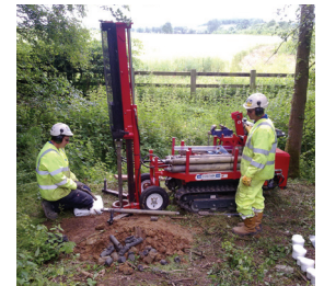
A motor-driven hammer pushes a cone into the ground for dynamic probing.

The probe typically reaches a depth of up to 10m. Many locations can be investigated in one day. The equipment can be used in urban and rural locations, and on difficult-to-access sites.