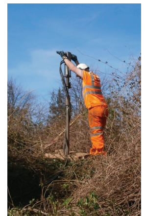
In difficult-to-access locations, hand-held equipment can be used.

A steel tube is rotated into the ground to a depth of 5-10m. The tube is then extracted and a section of it is removed, or a flap is opened, to view a sample of the ground structure below the surface. Samples can be taken for laboratory testing. This technique can be used in multiple locations in one day, and in both urban and rural locations. It requires one or two people to operate.