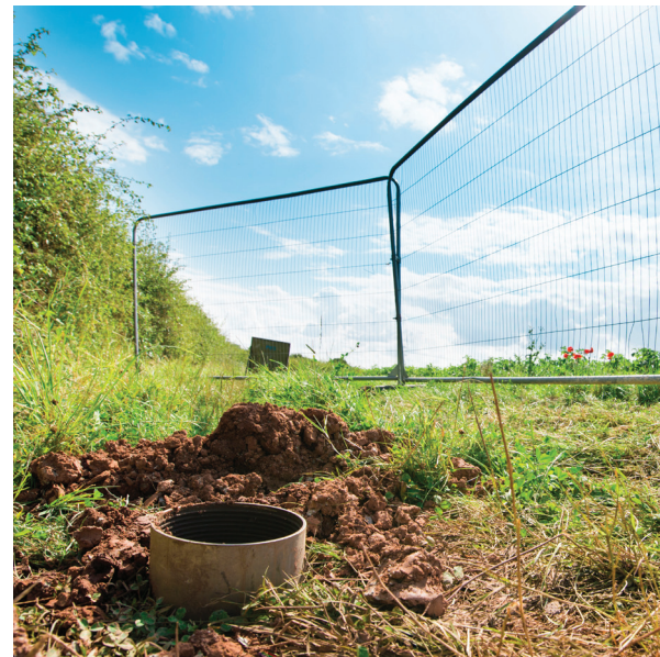
On completion, boreholes are filled or further instrumentation installed.

On completion, the borehole is either filled in or instrumentation is installed – for example, to monitor water levels. Where an installation remains in place, the only thing visible is a small cover, level with the ground, or a small steel barrel to provide protection.