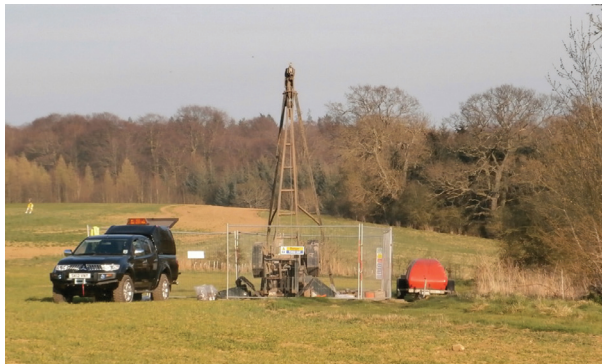
Cable percussion borehole.

A variety of tools are raised and lowered, either by a cable and winch or a series of steel rods, to drill the hole, take samples or carry out tests in the borehole.