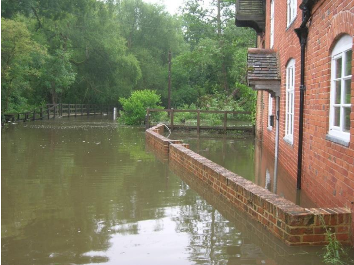
Henwood Lane ford showing water up to just under the bridge, short of a depth of 5 foot

However, browsing through some photographs I came across these, taken in the height of what should have been summer. Taken in July 2007. Liz Boxall