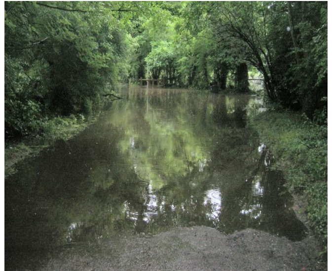
Ravenshaw Lane ford, the bridge is not accessible.