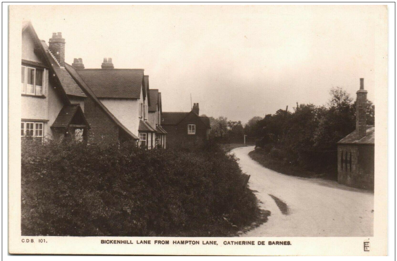
Photo of Bickenhill Lane, Catney, circa 1925 Is that the Button factory on the right?