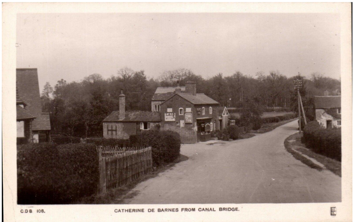
Photo from Canal Bridge, Catney circa 1925 Showing bakery.

By the very end of May/early June everywhere in the country is usually frost free, and it is safe to plant out tender Bedding plants, and non-hardy plants such as Agapanthus (some), Canna Lilly, Dahlias.