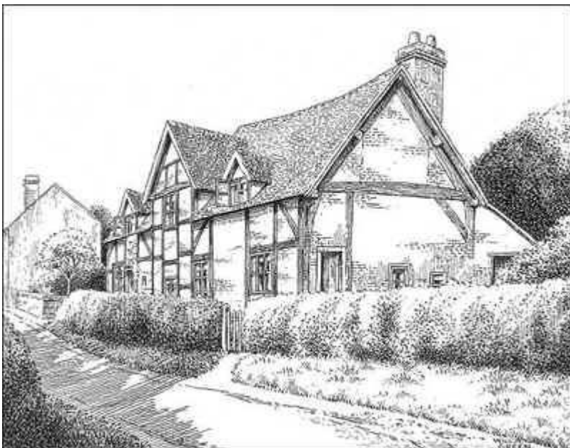
Catherine de Barnes, near Hampton in Arden, Warwickshire. Old cottages. (drawn c1950)