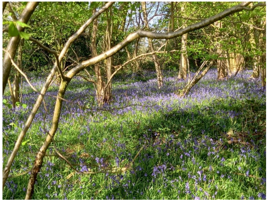
Views of the wood in April and May last year

Some of you may have heard that our native species might be outgrown by 'Spanish Bluebell', I can be reassuring that all of ours are native English bluebells. If you want to check, look out for the following features: