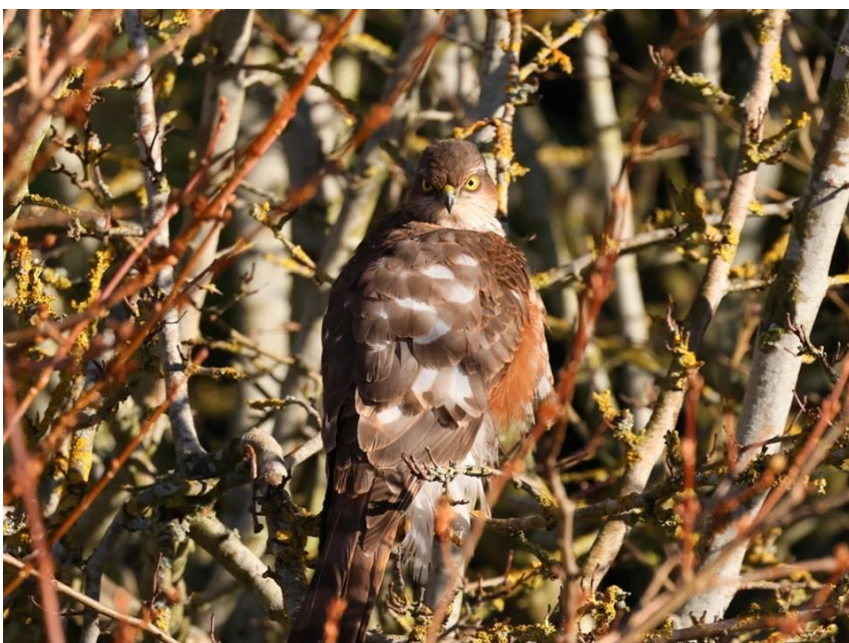
Sparrow Hawk